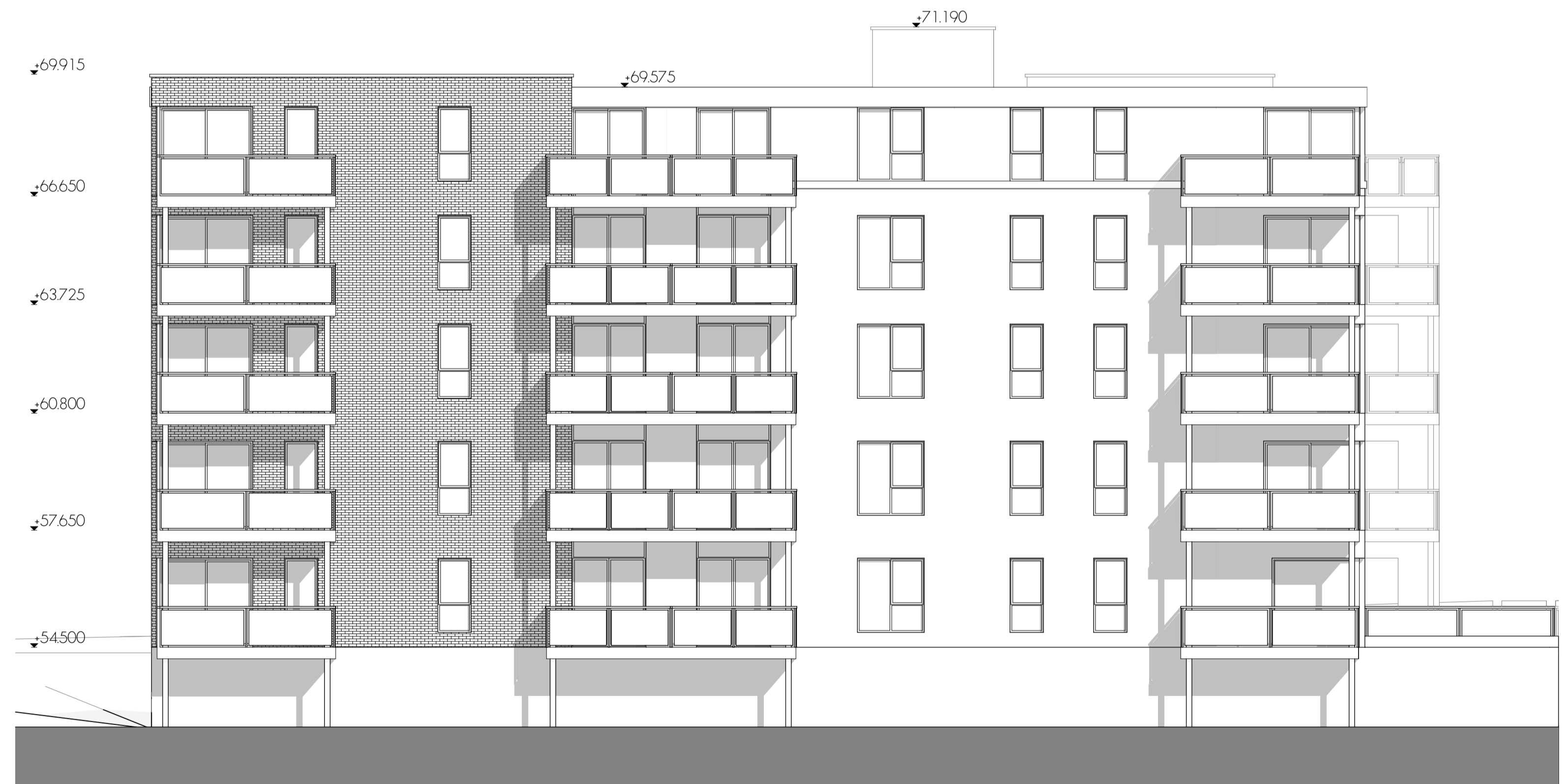
REAR ELEVATION (SOUTH) - BLOCK B 1:100