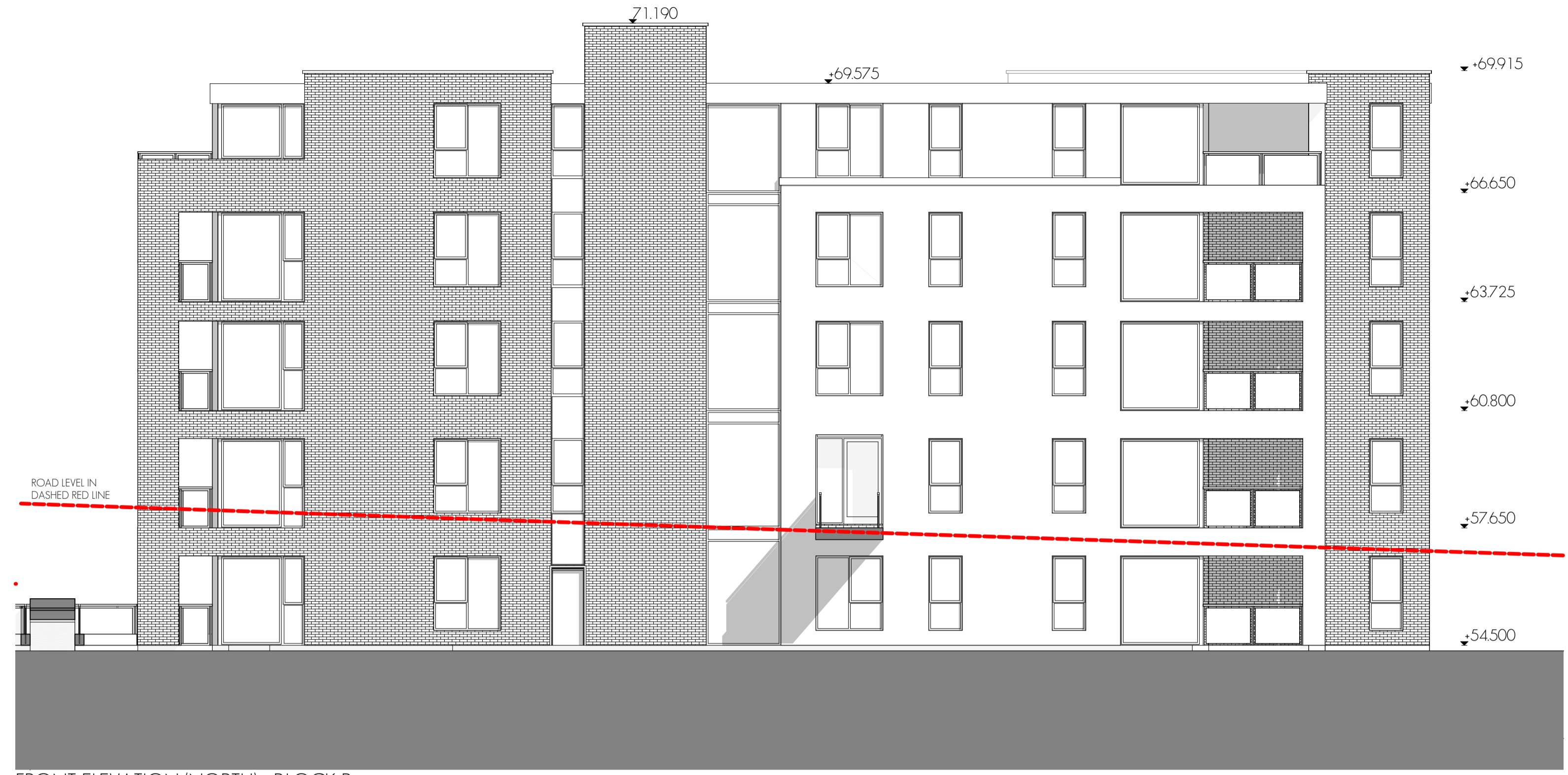
FRONT ELEVATION (NORTH) - BLOCK B 1:100

THIS DRAWING IS FOR PLANNING PERMISSION PURPOSES ONLY. FURTHER DRAWINGS AND STUDIES WILL BE REQUIRED FOR CONSTRUCTION AND TO ENSURE COMPLIANCE WITH RELEVANT BUILDING REGULATIONS AND STANDARDS. NOTE: Refer to 1:500 site layout drawings 18205-PLA-004, 18205-PLA-005, 18205-PLA-006, 18205-PLA-007, 18205-PLA-008, 18205-PLA-009 & 18205-PLA-010 for further details including all finished floor levels (FFL) & dimensioning.