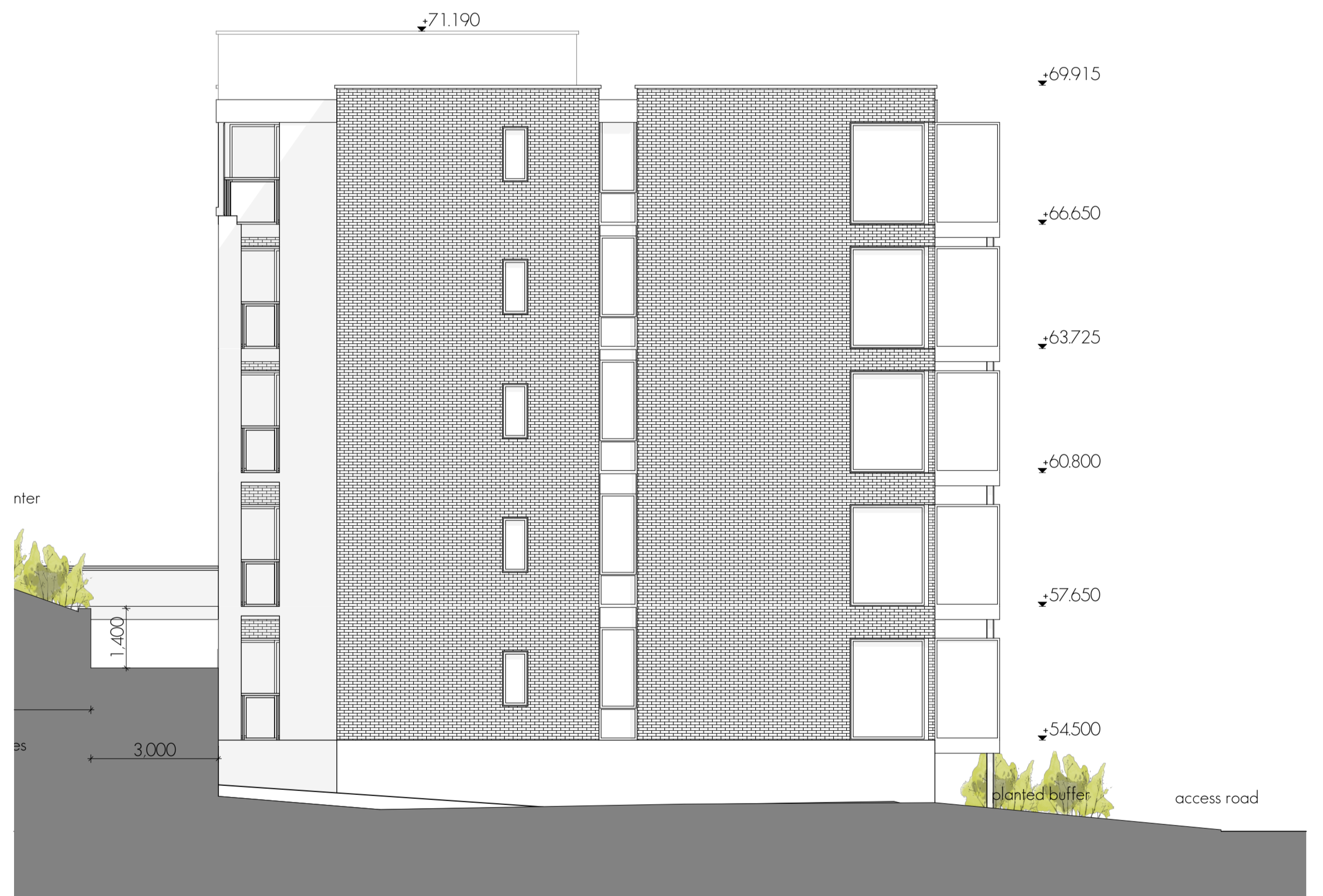
SIDE ELEVATION (WEST) 1:100